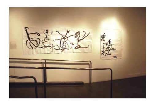
Figure 10: Installation of Neil Marcus drawing, from Medusa's Mirror exhibition, 2011, ProArts Gallery, Oakland

Performing Crip Time, held at Space4Art gallery in downtown San Diego in 2014, included a video installation of an outdoor performance by British artist Noëmi Laikmaer. In the documentation of the living intervention/performance, One Morning in May (2012), on the 28th