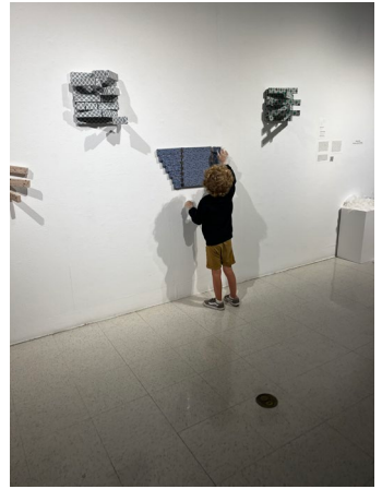
Figures 8-9: Dominic Quagliozzi, Transformers , 2022, installation as part of Script/Rescript exhibition at University Art Gallery at San Diego State University, curated by Amanda Cachia

Engaging in an encounter of tactility in a museum gives the disabled and non-disabled visitors an opening, and a new advantageous position, where they are empowered through haptic aesthetics and need not rely on discursive or representational regimes in art history to validate or sanction their experience. What is especially important to note is that the tactile realm, while empowering and benefitting a disabled audience, is also equally accessible to non-disabled visitors as well, including those from various socio-economic backgrounds and class categories. In sum, there is potential for touch to become a powerful egalitarian modality if museums provide the resources to educate its public on how tactility can effectively be utilized. The