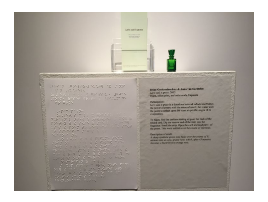
Figure 4: Braille label and typed label which includes image description and smell description for work by Brian Goeltzenleuchter and Anna van Suchtelen, Let's call it grass, 2015, poem, offset print, artist-made fragrance In the Fall semester of 2022, the author collaborated with a class of students once again on audio descriptions, this time for a project that was curated for the University Art Gallery at San Diego State University. Script/Rescript featured the artwork of ten artists who use historical and contemporary medicalizing scripts of their own bodies to colorfully rescript – or rewrite – visual language attributed to individual conditions of disability. An X-ray, a prosthesis, a cane, a crutch, a pill, a wheelchair tire, and a syringe are among the foundations on which to build new creative layers of empowered self-described embodiment. The work in this exhibition conveyed disabled identity via new mapping, through-lines and mark-making, wherein the artists reject pathological archives by injecting their medical histories with memories, lived experiences, and sensorial attributes. The exhibition was incorporated into a class which was held in conjunction with the exhibition and taught by the author. The students were asked to develop image descriptions for each work in the exhibition, along with label copy about the works which required that the students liaise directly with the participating artists. Similar to the approach to audio descriptions and captions in Sweet Gongs Vibrating, the students were asked to consider